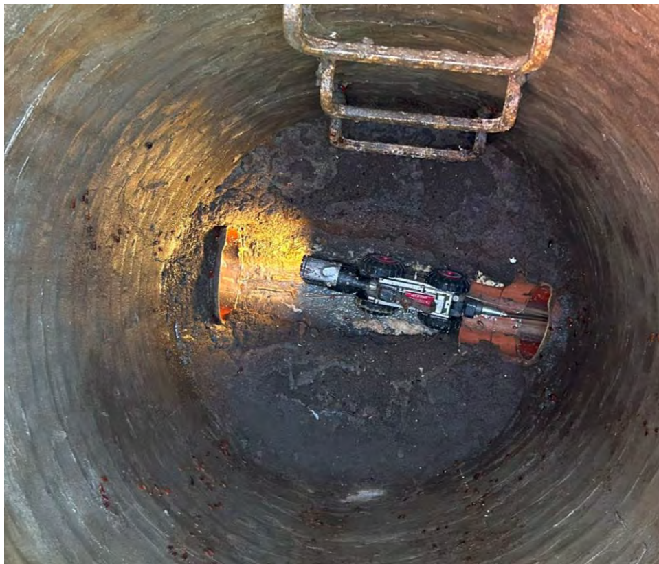
Video Camera in sewer line