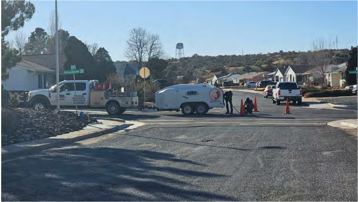
HEI clearing an obstructed line identified during the video scoping of the wastewater lines