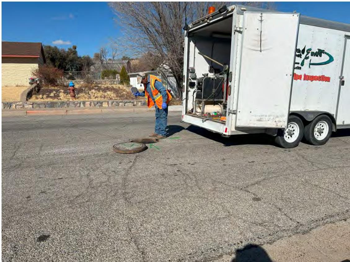
Southwest Envioserv scoping the sewer lines