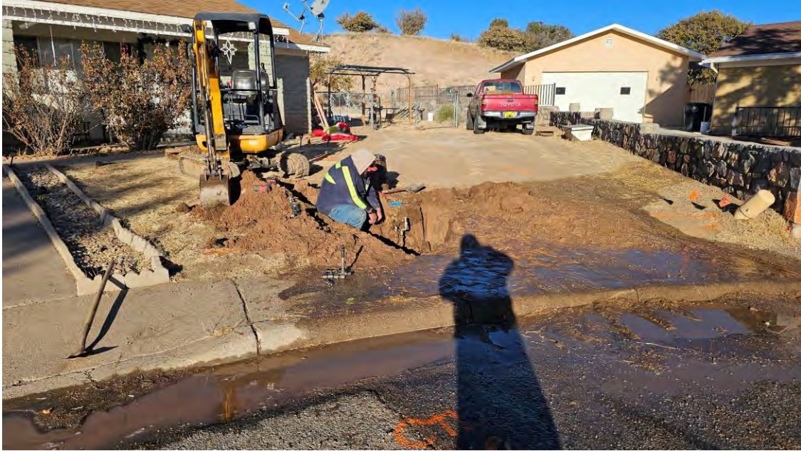
Broken water valve (curb stop) replacement on Chalcopyrite Court