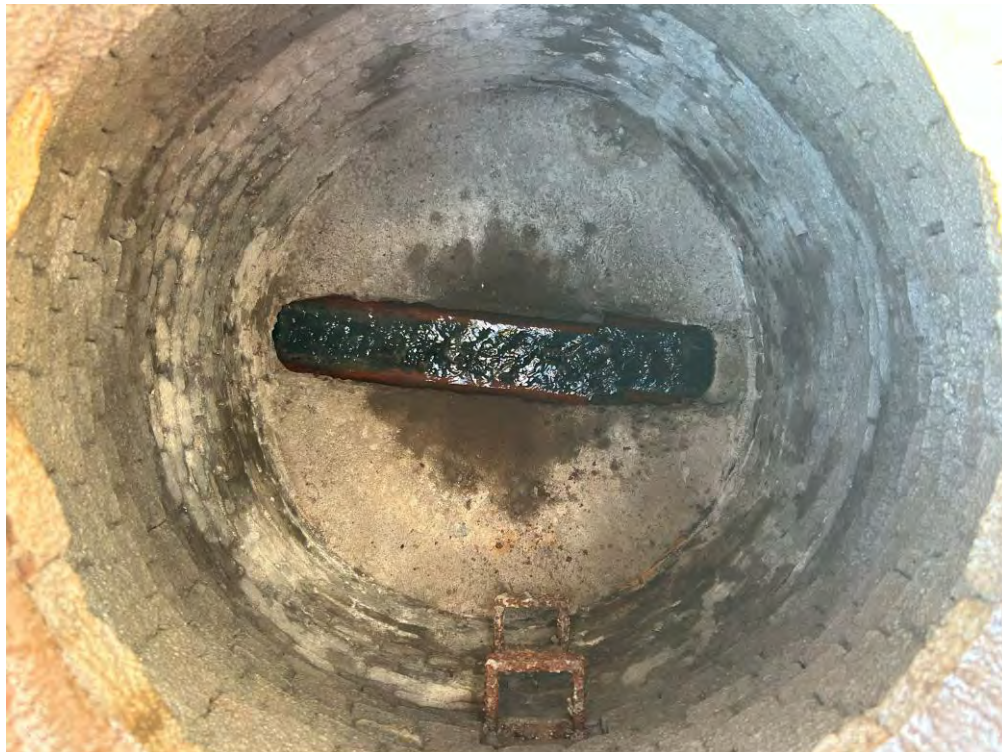
Inside a typical manhole in Tyrone