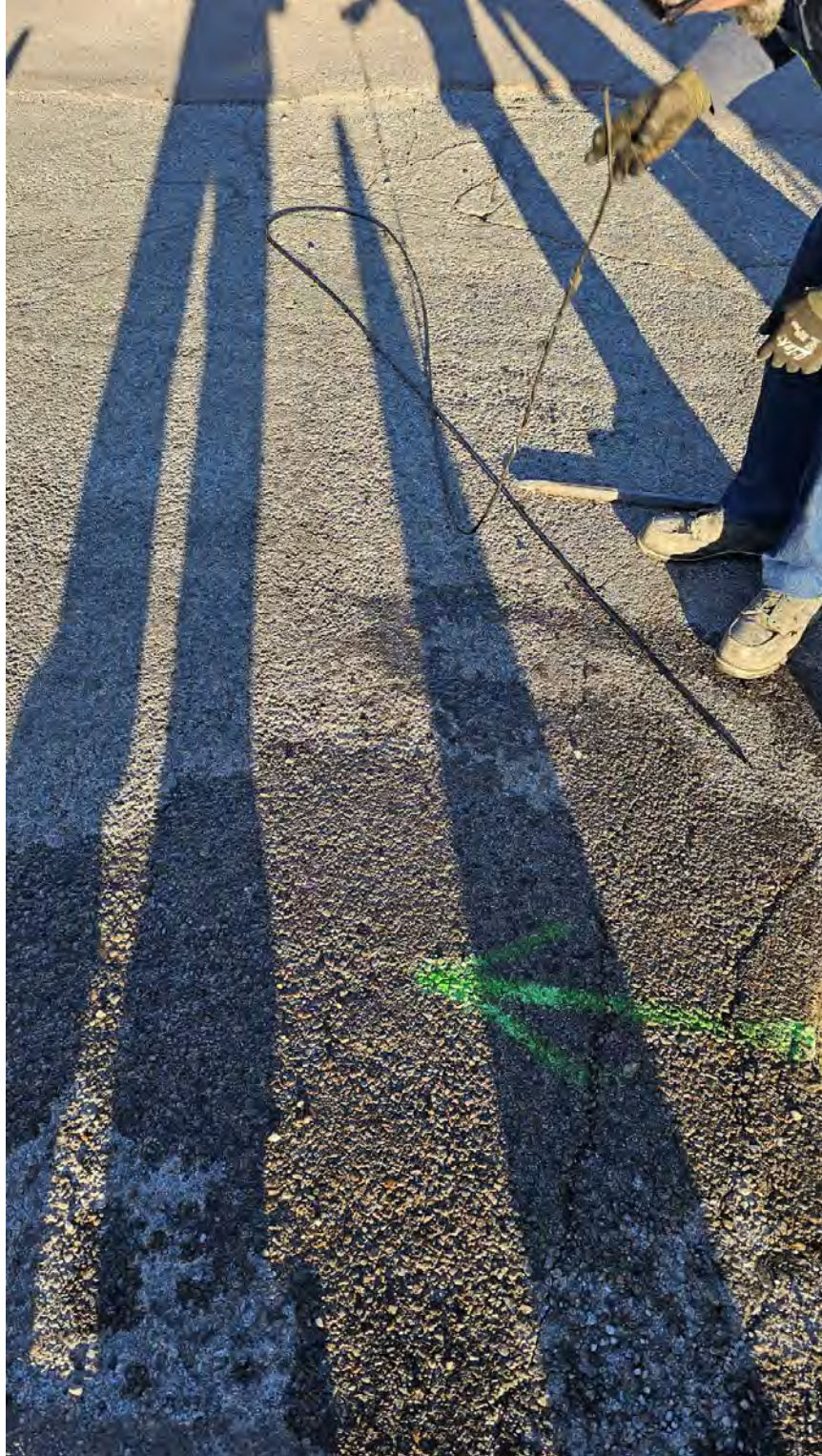
Broken steel line inside sewer line An unknown homeowner or plumber lost this device and it ended up in our main wastewater lines