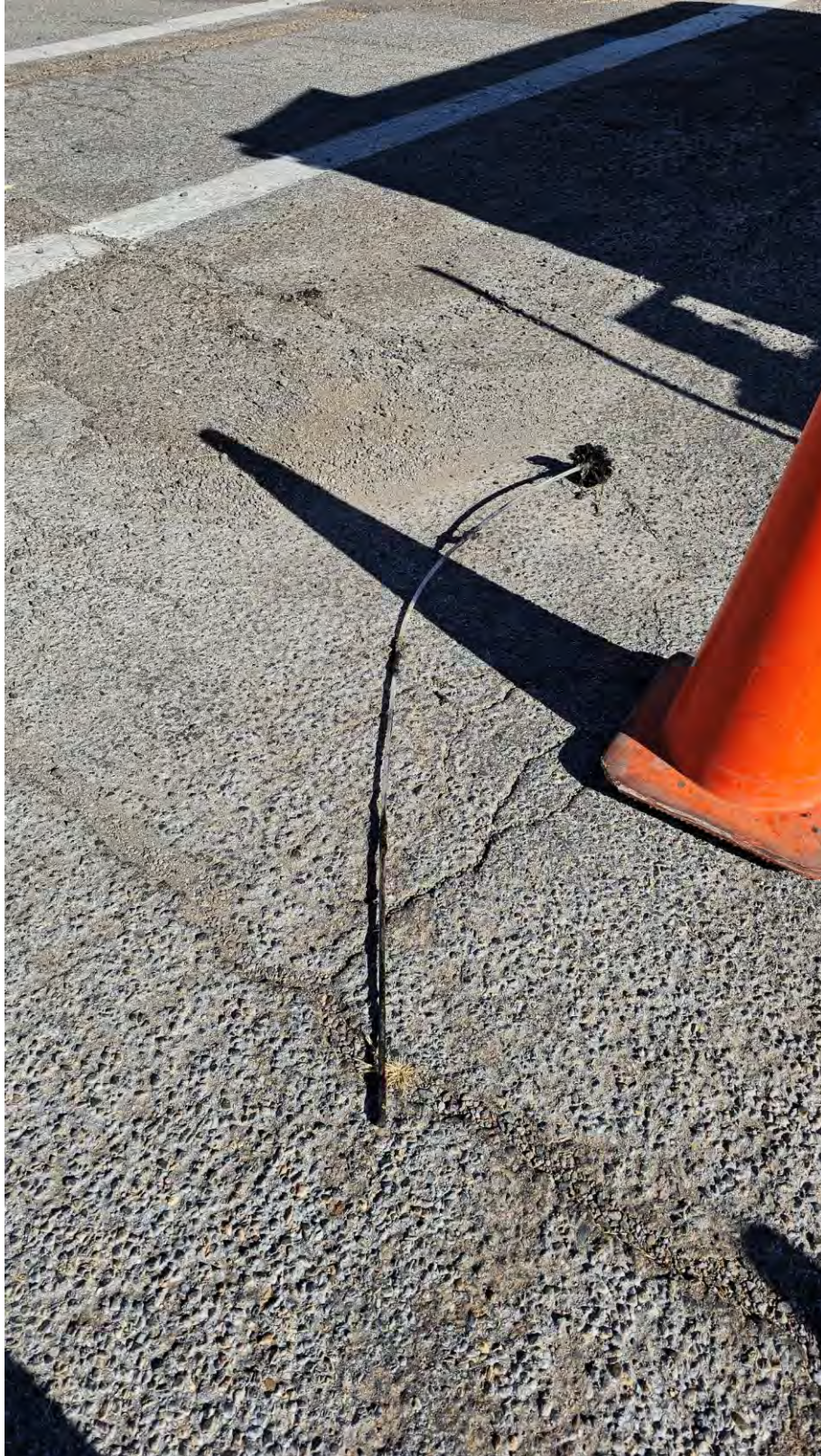
Recovered chimney sweep brush in sewer line during video scoping. BTW this doesn't belong in our wastewater lines